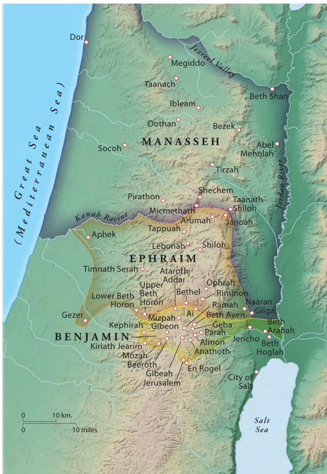
Map to help visualize descriptions of boundaries of Manasseh

The sons of Joseph said, "The hill country is not enough for us - Click this map and note the hills north of the designation "JUDAH" to give you a good sense of where the hill country was located. Now the sons of Joseph begin with excuses, giving two reasons they are not receptive of Joshua's "hill country" proposal! First, the "hill country" was not sufficient, even though it was given by divine lot. Perhaps God did not realize that He had short-changed the sons of Joseph! (Being sarcastic of course).