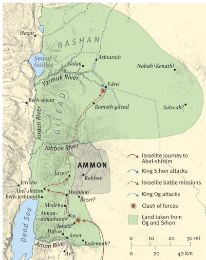
Bashan and Gilead (ESV Study Bible) (Click to Enlarge)

on Asher, Zebulun, and Issachar. The boundary with these northern tribes evidently passed through the Jezreel and Harod valleys, which were divided among them. But cities such as Beth Shan, Ibleam, Dor, Endor, Taanach, and Megiddo, while assigned to Manasseh (v. 11), were difficult to capture because of the strength of the Canaanites in the plain, who possessed iron chariots (v. 16)—a fact well known from the annals of Thutmose III (p. 101). It probably was not until the reigns of David and Solomon four hundred years later (i.e., 1010–931 BC) that the Israelites were able to take control of these powerful cities. Since the choice land on the plains was controlled by the Canaanites, the sons of Joseph (Ephraim and Manasseh) settled in the heavily forested hill country, cutting down trees to secure needed farmland (vv. 15–18). ( Zondervan Atlas of the Bible )