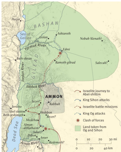
Bashan and Gilead (ESV Study Bible) (Click to Enlarge)

on Asher, Zebulun, and Issachar. The boundary with these northern tribes evidently passed through the Jezreel and Harod valleys, which were divided among them. But cities such as Beth Shan, Ibleam, Dor, Endor, Taanach, and Megiddo, while assigned to Manasseh (v. 11), were difficult to capture because of the strength of the Canaanites in the plain, who possessed iron chariots (v. 16)—a fact well known from the annals of Thutmose III (p. 101). It probably was not until the reigns of David and Solomon four hundred years later (i.e., 1010–931 BC) that the Israelites were able to take control of these powerful cities. Since the choice land on the plains was controlled by the Canaanites, the sons of Joseph (Ephraim and Manasseh) settled in the heavily forested hill country, cutting down trees to secure needed farmland (vv. 15–18). ( Zondervan Atlas of the Bible )