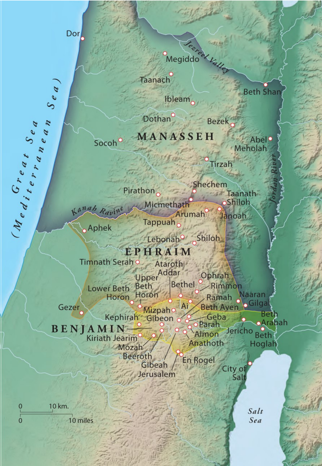
Map to help visualize descriptions of boundaries of Manasseh Zondervan Atlas of the Bible: C. Rasmussen (recommended resource - do not reproduce) CLICK TO ENLARGE