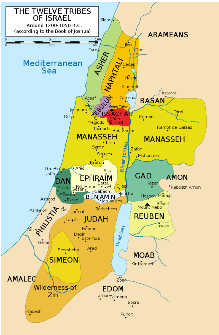
Map to help visualize descriptions of boundaries CLICK TO ENLARGE